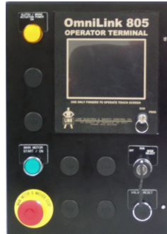
805 OIT Mounted in New Enclosure