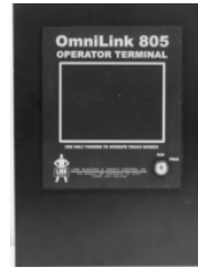
805 OIT Mounted in 7R Panel Replacement